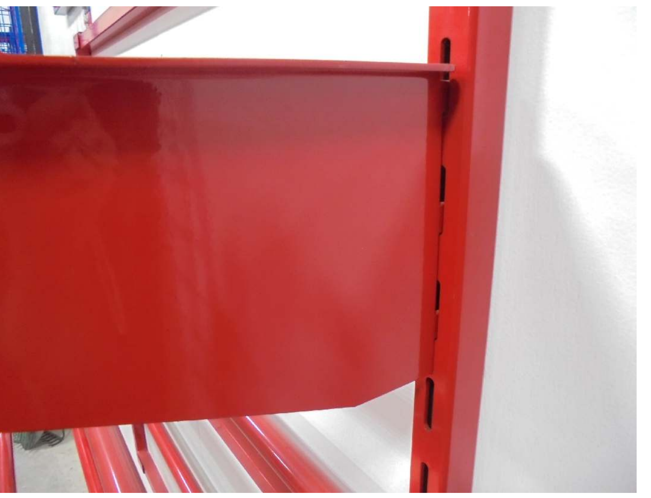
STEP 2: ONCE FRAME IS IN PLACE HANG YOUR SHELVES IN DESIRED LOCATION AS SHOWN ABOVE. THE THREE TABS ON SHELVES MATE TO THE SLOTS ON THE VERTICAL TUBES.