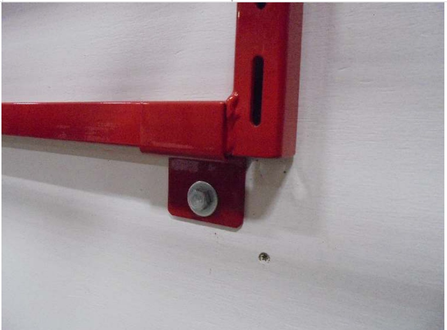
STEP 1: MOUNT WELDED FRAME TO DESIRED LOCATION USING THE SUPPLIED WALL MOUNT BRACKETS. ENSURE THE SLOTTED TUBES ARE ORIENTED VERTICALLY.