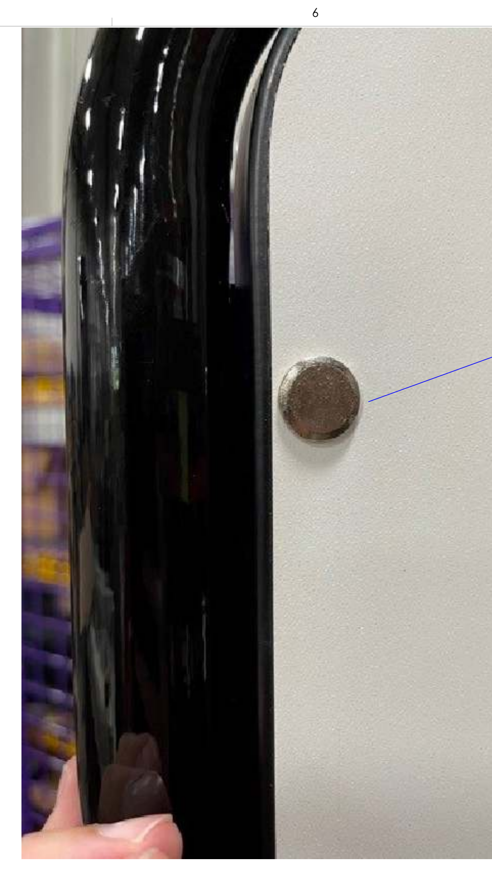
STEP 1 PLACE SHELF 25" ABOVE THE SEAT