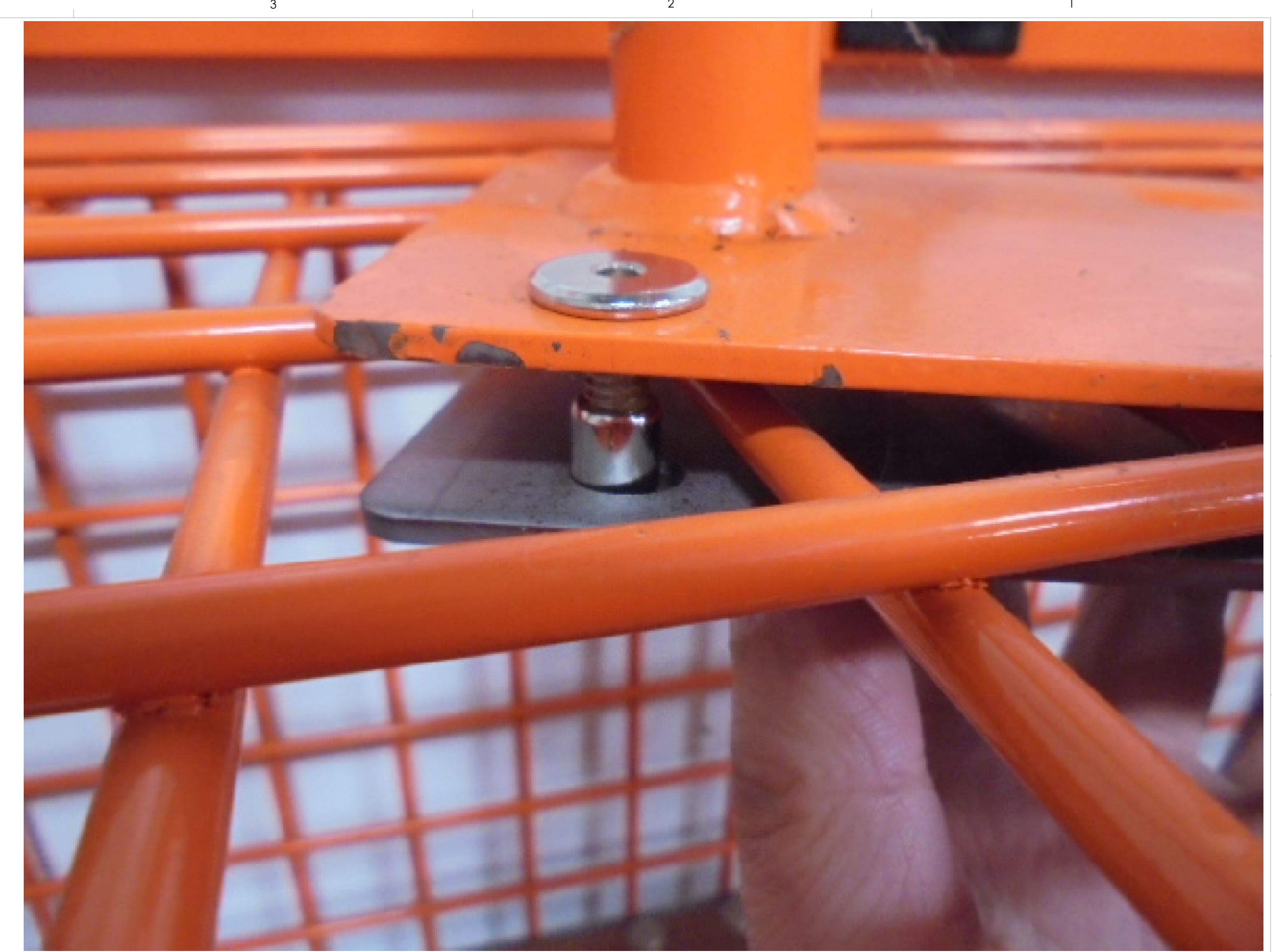
STEP 3: LINE UP BACKING PLATE AND INSTALL THE HARDWARE. TIGHTEN HARDWARE