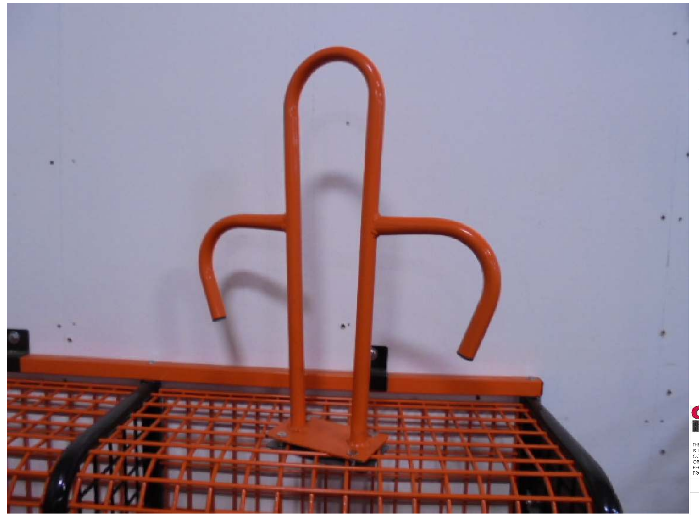
STEP 5: LOAD YOUR GEAR