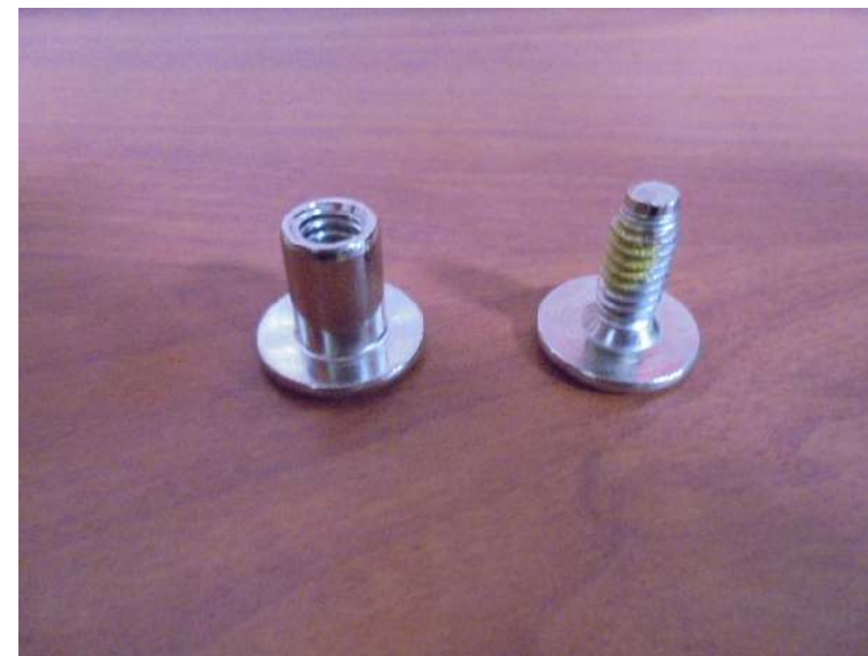
STEP 2: GATHER BACKING PLATE AND HARDWARE