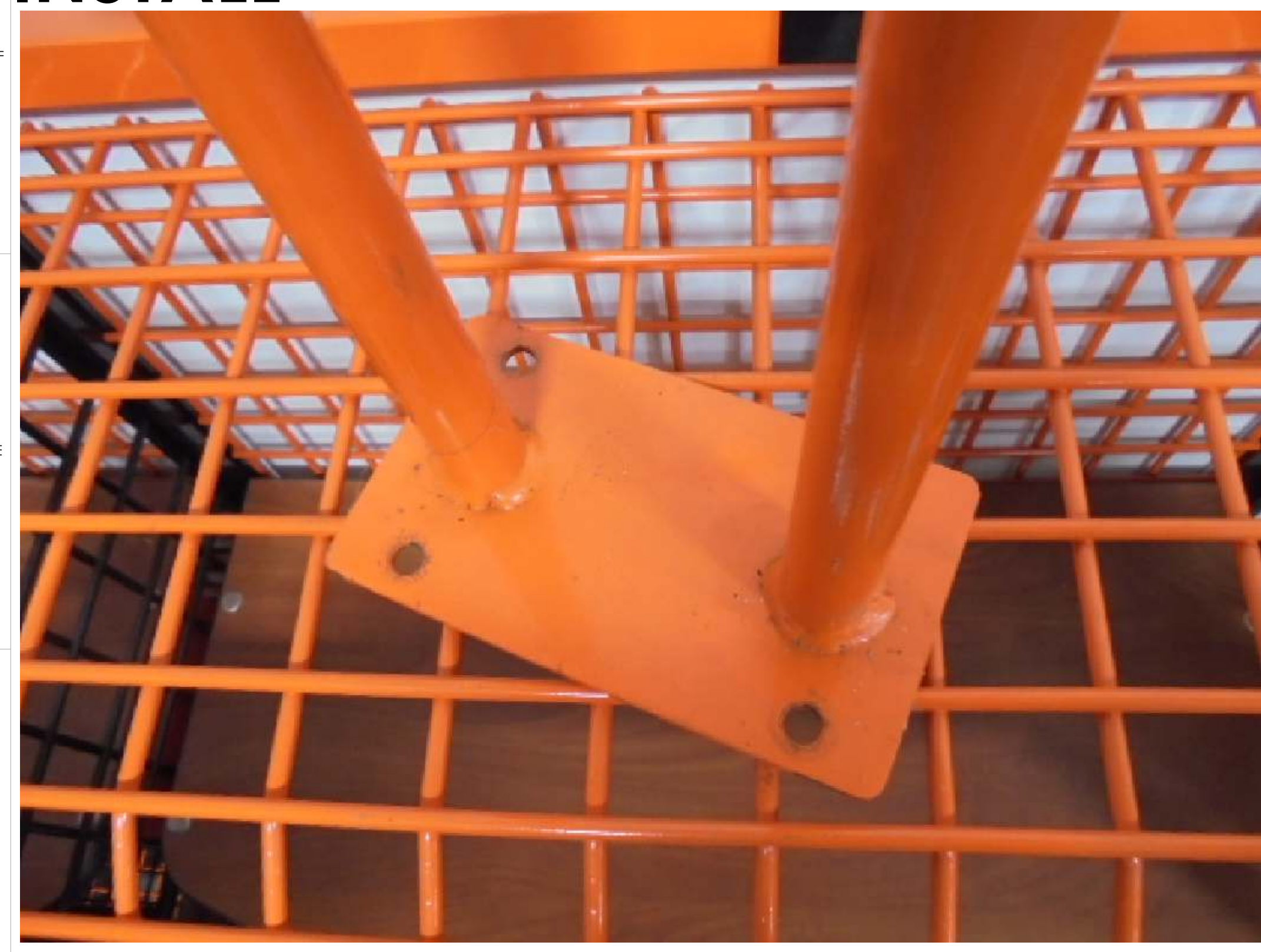
STEP 1: POSITION GEAR HOLDER IN DESIRED LOCATION. ENSURE HOLES ARE POSITIONED TO LOCK HOLDER IN PLACE ONCE FASTENERS ARE INSTALLED. (HOLES ON OPPOSITE SIDES OF WIRE TO HOLD IN PLACE)